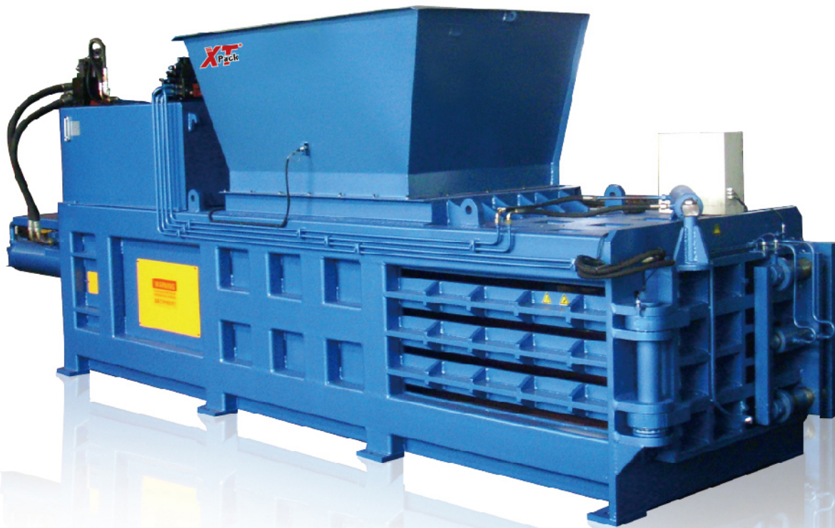
Bale Size (Model XTY-1000WB11085)

Specialized in recycling and compressing the loose materials like plastic film, PET bottles, plastic pallets, waste computer shell, waste paper, cartons, cardboards trims/scraps, foam etc.